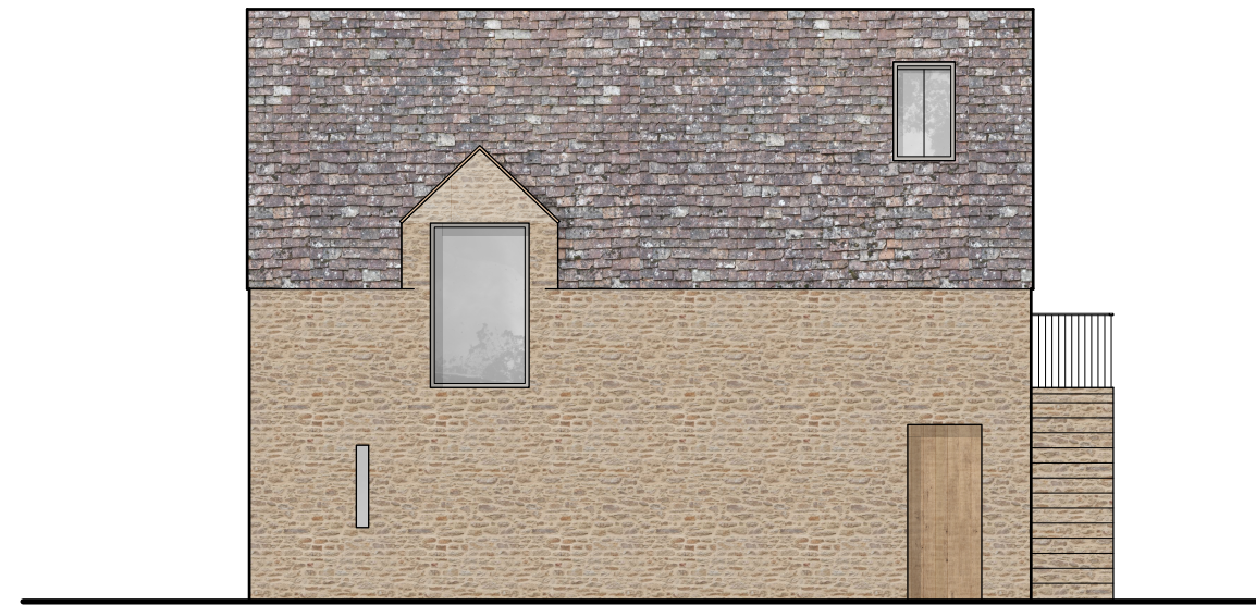
2 Bedrooms 1, 2 & 3 East Elevation Scale: 1:100